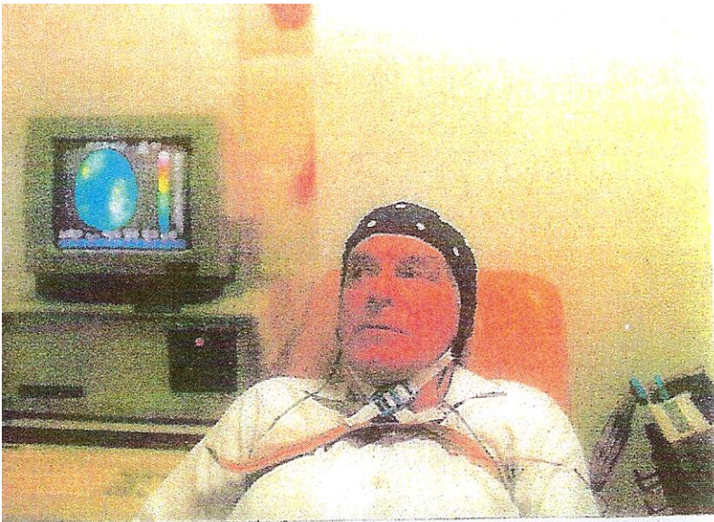
Patient connected to the Neuro-Science Brain Imager and ear clips on the ear lobes connected to the Electro-Acuscope (not in picture).